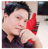
By: T S Haokip

The just declared UPSC 2019 results have seen a particular ST community outside the North-Eastern region grabbing nearly 40% of the total ST seats reserved. This is not the first instance and not the only type of examinations dominated by the said particular community; SSC, IBPS, and Railways- the largest recruiter for Govt and Public sector enterprises too have similar pictures. The founding fathers of our constitution having felt the genuine need for an idea of equality in terms of employment and opportunities apart from politics had envisaged in the constitution the provision for the state to reserve seats for certain sections of the society who were underprivileged, backward and cut out from social, political and economic developments not just under the British Raj but for centuries altogether. While many argued that the idea of positive discrimination is against equality, it is in practice an initiative to ensure equality on a larger perspective. The idea of the importance of representation in legislation has among many- a geographically earmarked constituency and as such has met its intended purpose. However, in the case of job opportunities, there is a systematic flaw; it does not guarantee equitable opportunities to all as more backward communities in the STs are yet to taste the fruit of reservation.